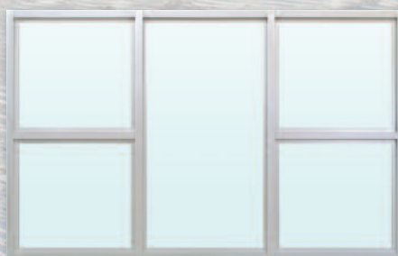
SERIES DHS-500 STOREFRONT/ WINDOW WALL

Impact Resistant Out-Swing and In-Swing Medium Stile Entrances