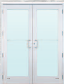
SERIES DH-350 SINGLE AND PAIRS OF DOORS

KYNAR® is a registered trademark of Autofina Chemicals, Inc.